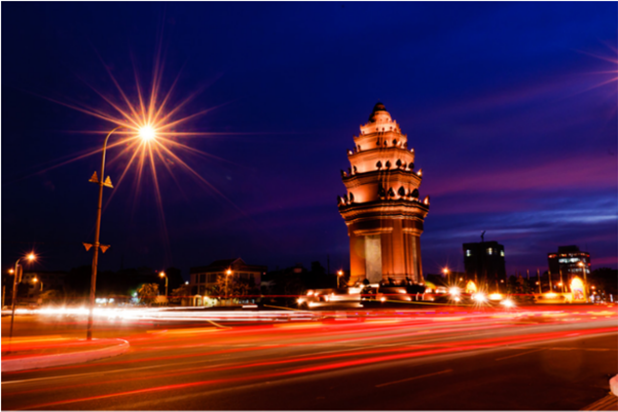
Night view of Independence Monument

The EU-ASEAN Business Council is collecting responses for its annual EU-ASEAN Business Sentiment Survey this year and all European-based companies operating in ASEAN are encouraged to participate.