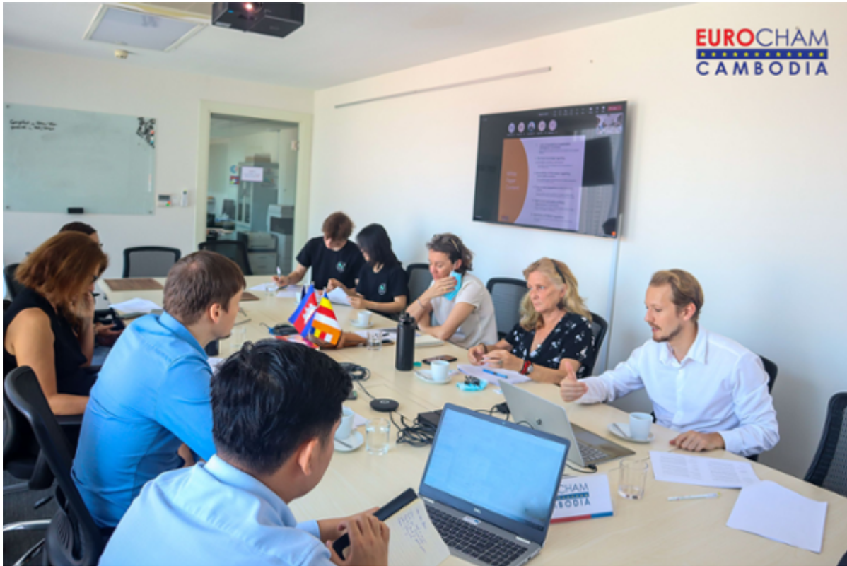
EuroCham's SPA Group met Thursday to discuss its forthcoming white paper on sustainability.

The Sustainable Production Action (SPA) Group met Thursday afternoon to discuss their upcoming white paper on policy recommendations to improve the sustainable business climate in Cambodia.