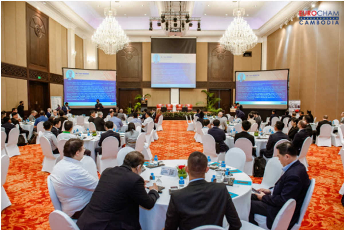
EuroCham hosted its Tall Buildings Forum on June 22, bringing together industry leaders from the private and public sectors.

EuroCham hosted a successful return of the Tall Buildings Forum at Sofitel Phnom Penh Phokeethra on Wednesday as leaders in the industry met to discuss new trends and challenges in the rapidly changing sector.