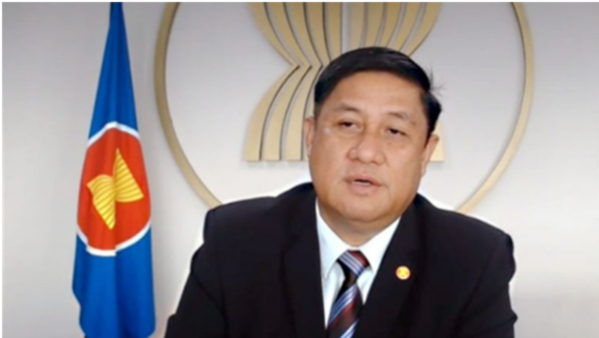
Ekkaphab Phanthavong, deputy secretary-general of the ASEAN Socio-Cultural Community, advocated for collaboration to tackle marine plastic pollution at the regional forum.

The ASEAN Secretariat and the World Bank are stepping up efforts to combat plastic pollution in the region.