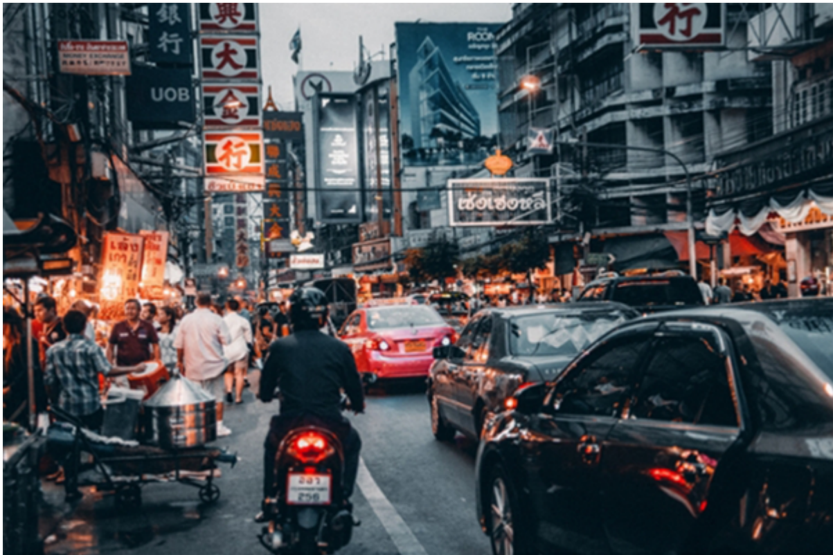
China Town in Bangkok

An exclusive regional conference on the MSME landscape will be held in Bangkok on June 27 and 28.