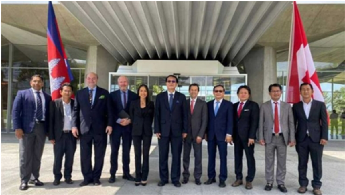
Minister of Commerce Pan Soasak (centre) visited the Nestle headquarters in Switzerland last wee.

Switzerland-based confectionary manufacturer Nestle has stated its plans to invest in Cambodia by opening an operation in the near future.