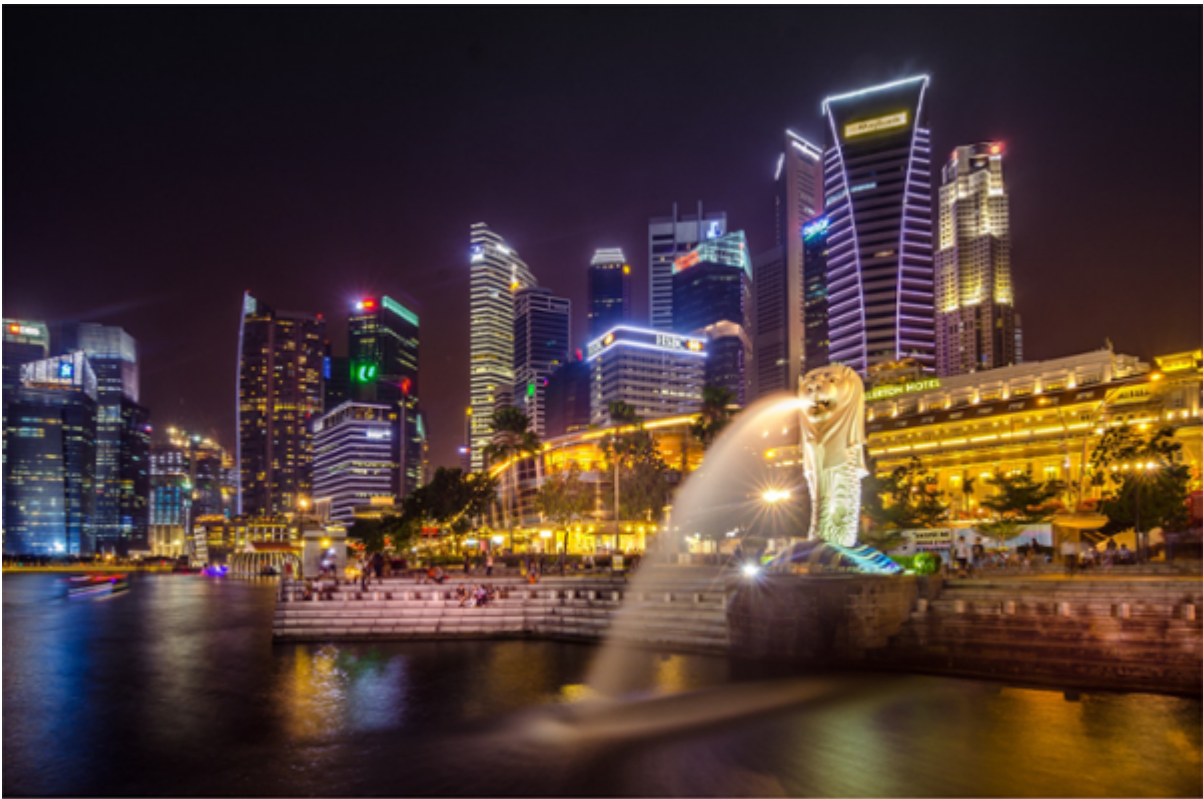
Singapore recently started importing renewable energy from Laos.

In a first for Singapore, the city-state started importing renewable energy from Laos via Thailand and Malaysia this week.